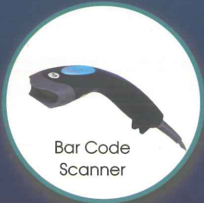
Bar Code Scanner